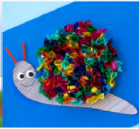
Tissue Paper Snail Craft