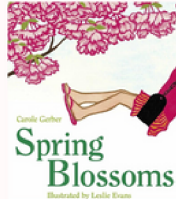
Spring Blossoms by Carole Gerber