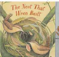
The Nest That Wren Built by Randi Sonenshine