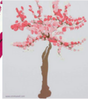
Cherry Blossom Craft