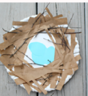
Paper Plate Nest Craft