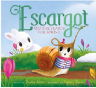
Escargot and the Search for Spring by Dashka Slater