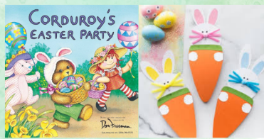
Corduroy's Easter Party by Don Freeman