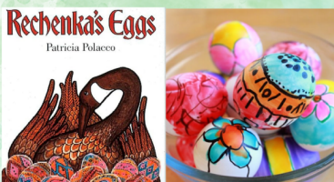
Rechenka's Eggs by Patricia Polacco